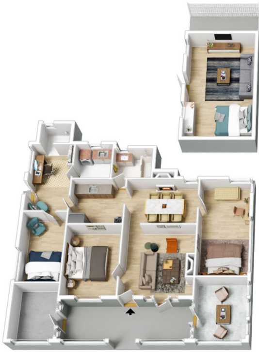
2 Clarke Street