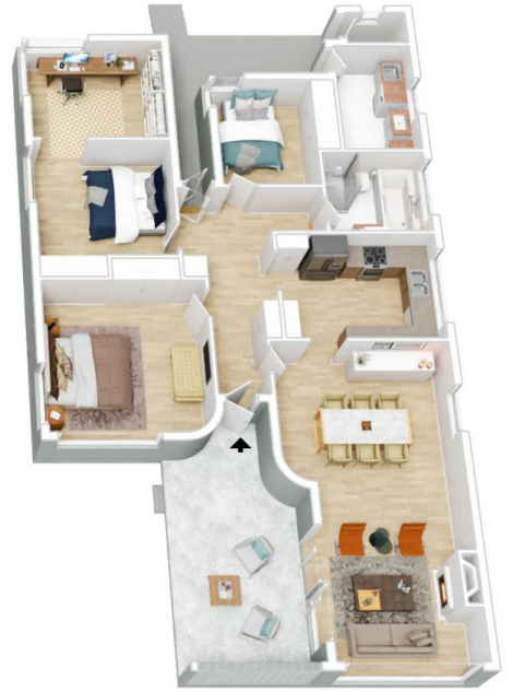
4 Clarke Street